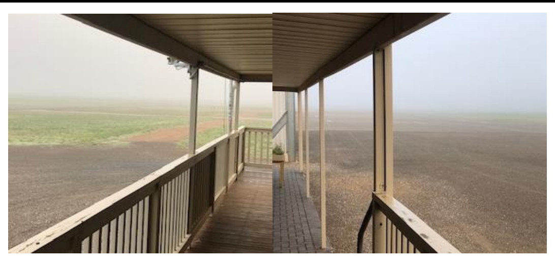
A misty morning – looking to 23 this side