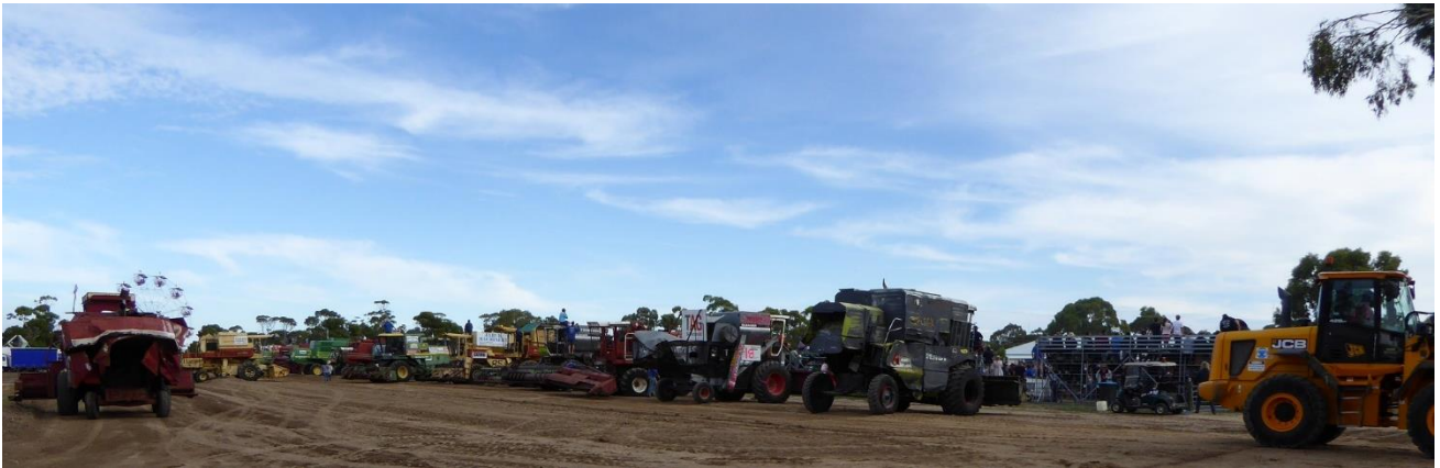
A huge line-up of participants