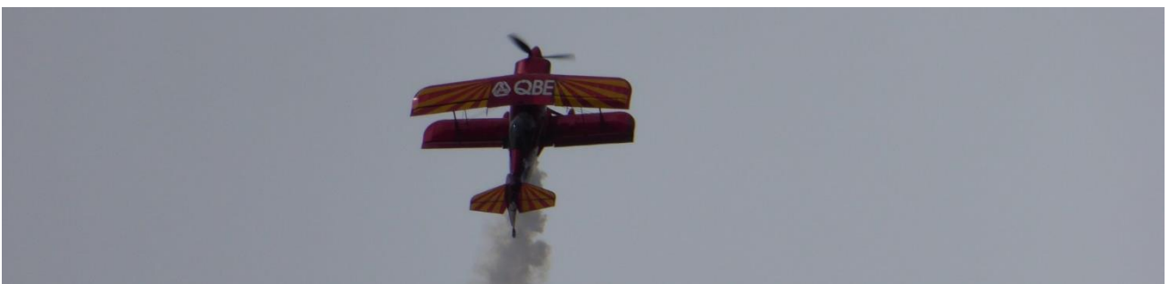
The obligatory aero displays.