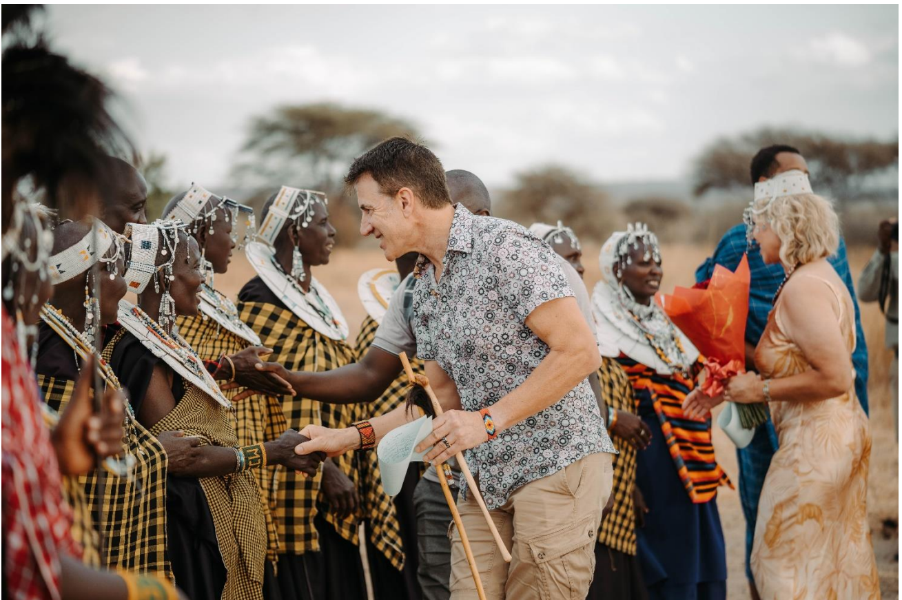
An official greeting line. Note the spectacular head and neck dresses.