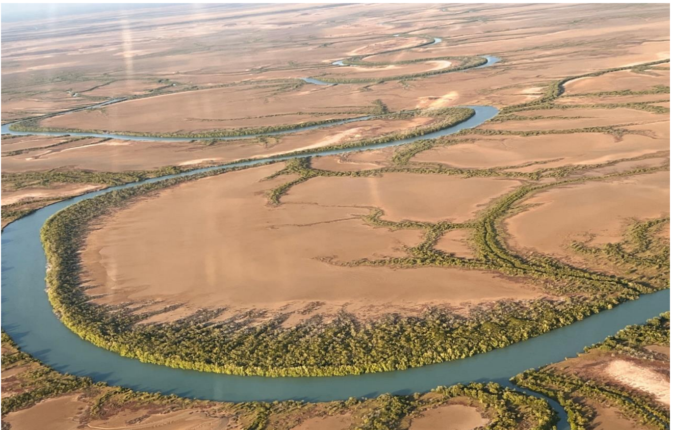
The story of the Morning Glory

Out-landing options are NOT great. Mud flats and crocodiles!!!!